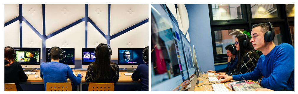
© 2022 Università Cattolica del Sacro Cuore

Opening hours and services of the Media Library are listed on the Milan Library's website into the page biblioteche.unicatt.it/mi-mediateca